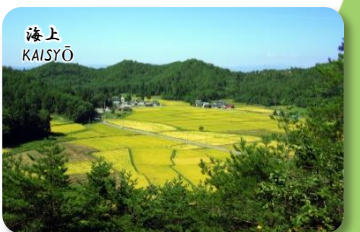
Kaisho (Takahata Town)