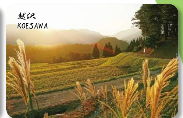
Koesawa (Tsuruoka City)