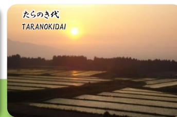
Taranokidai (Tsuruoka City)