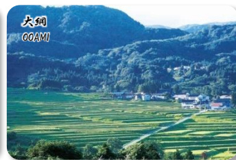
Ooami (Tsuruoka City)