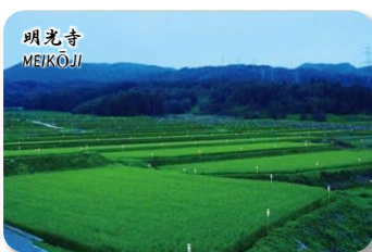
Myokoji (Obanazawa City)