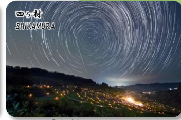
Shikamura (Okura Village)