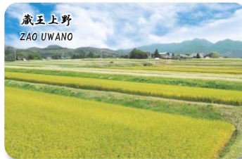
Zao-Uwano (Yamagata City)