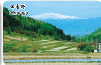
Tamugino (Tendo City)