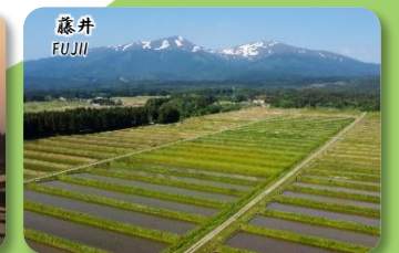
Fujii (Yuza Town)

Terraced rice fields, surrounded by mountainside villages, have been part of the scenery and natural environment for many years, and are a valuable space providing tranquility to the local people. Let's pass these fields down to the next generation by expanding and promoting local activities to maintain their beauty. In Yamagata Prefecture, we are selecting 'Yamagata's Top 20 Terraced Rice Fields' to support these endeavours.