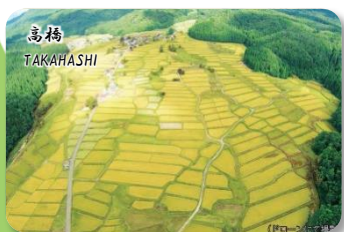
Takahashi (Obanazawa City)