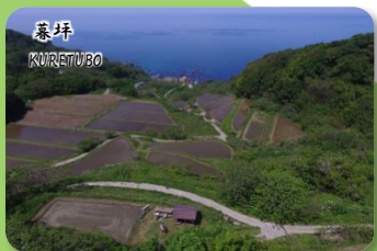
Kuretsubo (Tsuruoka City)