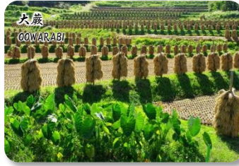
Oowarabi (Yamanobe Town)