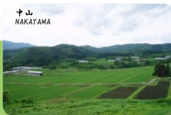
Nakayama (Shirataka Town)