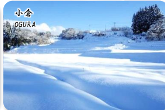
Ogura (Kaminoyama City)