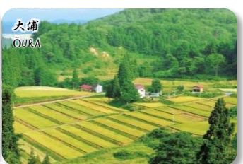
Ooura (Ooishida Town)