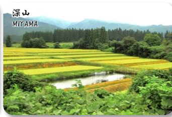
Miyama (Shirataka Town)