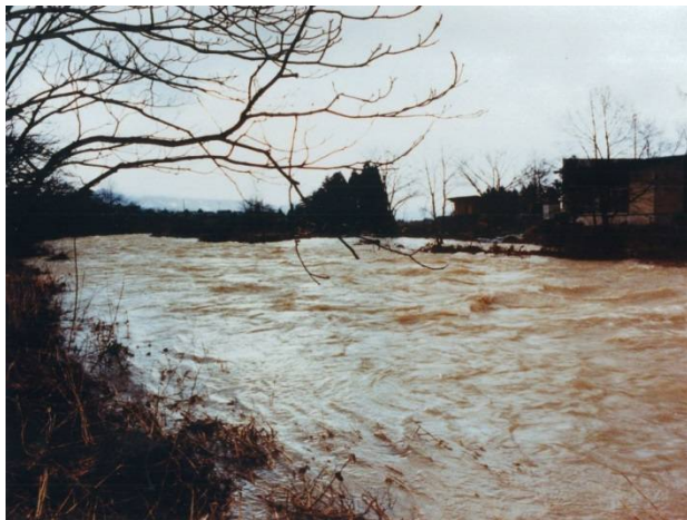
出水時の状況 (H元. 8. 6 (台風13号))